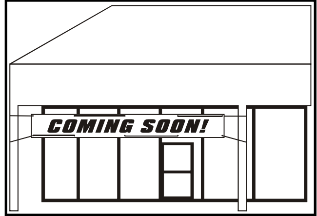
Rope Installation ("Shoestring" Method)